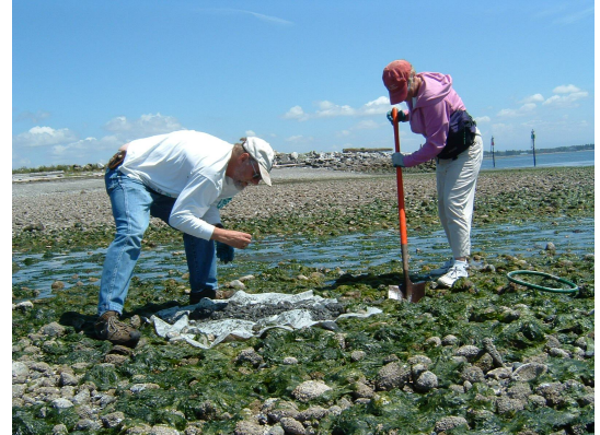
Birch Point 2005 Clam Survey- Number of Clams by Transect and Type

The table and charts below provide a description of the types and numbers of clams that were found at each transect and overall.