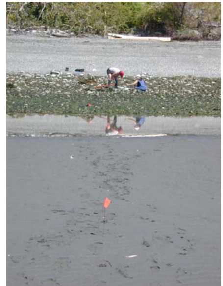
Point Whitehorn/Cherry Point 2005 Clam Survey-# of Clams by Transect & Type

The table and charts below provide a description of the types and numbers of clams that were found at each transect and overall.