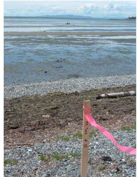
Birch Bay 2004 Clam Survey- Number of Clams by Transect and Type

The table and charts below provide a description of the types and numbers of clams that were found at each transect and overall.