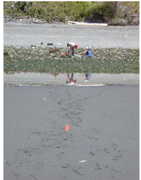
Point Whitehorn/Cherry Point 2005 Clam Survey-# of Clams by Transect & Type

The table and charts below provide a description of the types and numbers of clams that were found at each transect and overall.