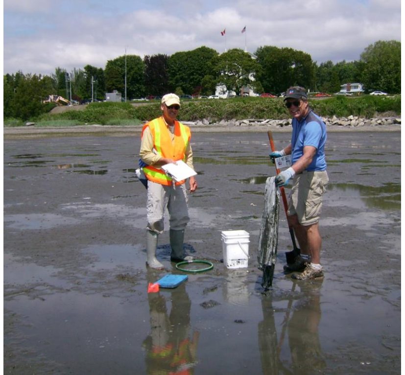
Table 1. Number of clams by species as surveyed on June 26 th , 2010 at Marine Park, Blaine.

The table and charts below describe the types and numbers of clams that were found at each transect and overall.