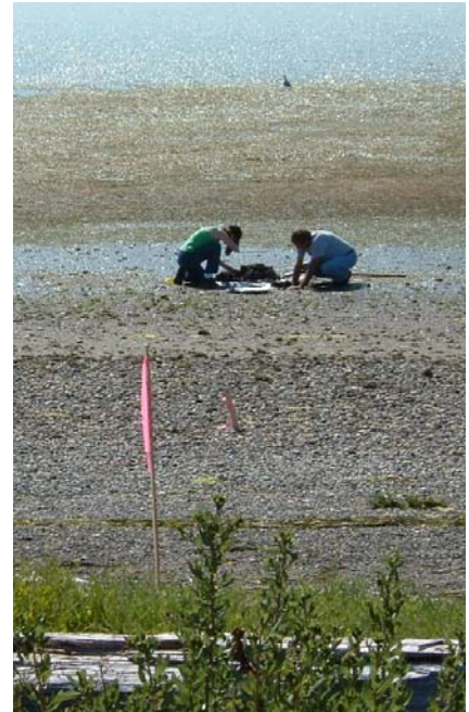
Semiahmoo Spit 2004 Clam Survey- Number of Clams by Transect and Type

The table and charts below provide a description of the types and numbers of clams that were found at each transect and overall.